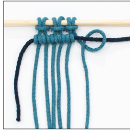
Double Half Hitch = DHH (pic 2)