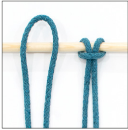
Lark's Head Knot (pic 1)