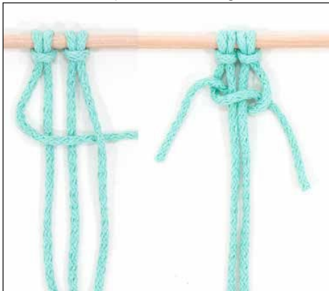
Pic 3: SK = square knot, stage 1