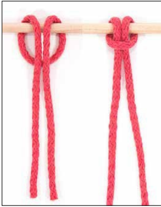
Pic 1: lark's head knot