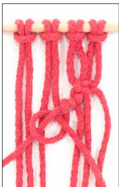
Pic 3: Diagonal Double Half Hitch = DDHH going down towards left