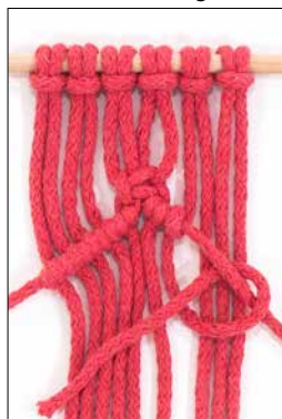
Pic 4: Diagonal Double Half Hitch = DDHH going down towards right