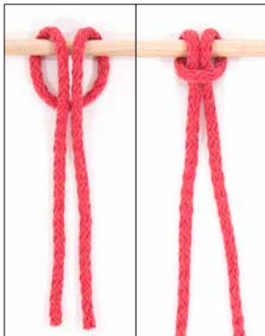
Pic 1: Lark's Head Knot = LHK